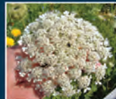
Queen Anne's Lace