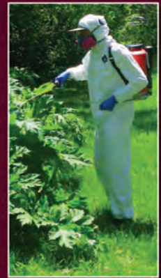
Spraying with herbicide