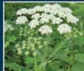
Cow Parsnip May cause burns.