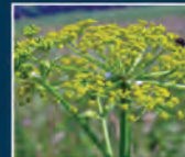
Wild Parsnip Don't touch! Can cause severe burns.

Giant hogweed is an invasive, non-native plant classified as a noxious weed. It is unlawful to propagate, sell or transport. In addition to being a health concern, it crowds out other plants and causes soil erosion.