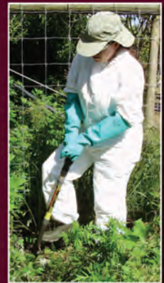
Cutting the plant root