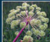
Angelica May cause burns.