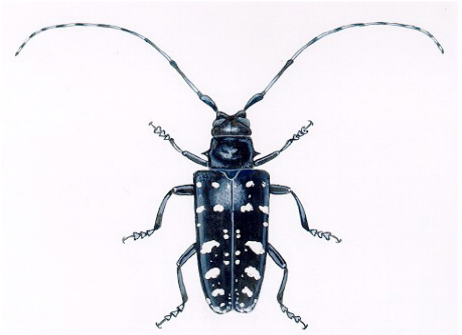
approximate actual size

Cut out each rectangle; do not follow contour of the antenna, it will be too floppy for the mask. Color antenna segments- white or blue on the bottom of each segment and black on the top of each segment. Fold the rectangle in half lengthwise, and staple the long thin rectangle shut. Staple antennae onto mask using the white space at the bottom.