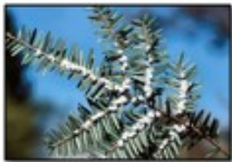
Hemlock Woolly Adelgid