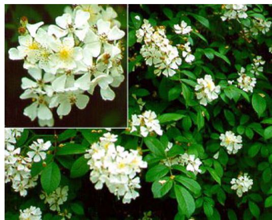
Flowers in spring and early summer with clusters of white to pinkish-white flowers and produce red berries in fall.

For a free invasive plant species identification guidebook stop by our office!