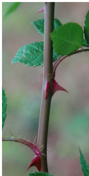
Large thorns with mostly green or red stems