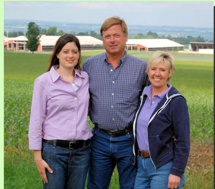
2008 Statewide AEM Award Fessenden Dairy, Cayuga