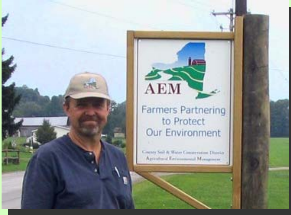
AEM Roadside Sign Award E-Z Acres Farms, Cortland County