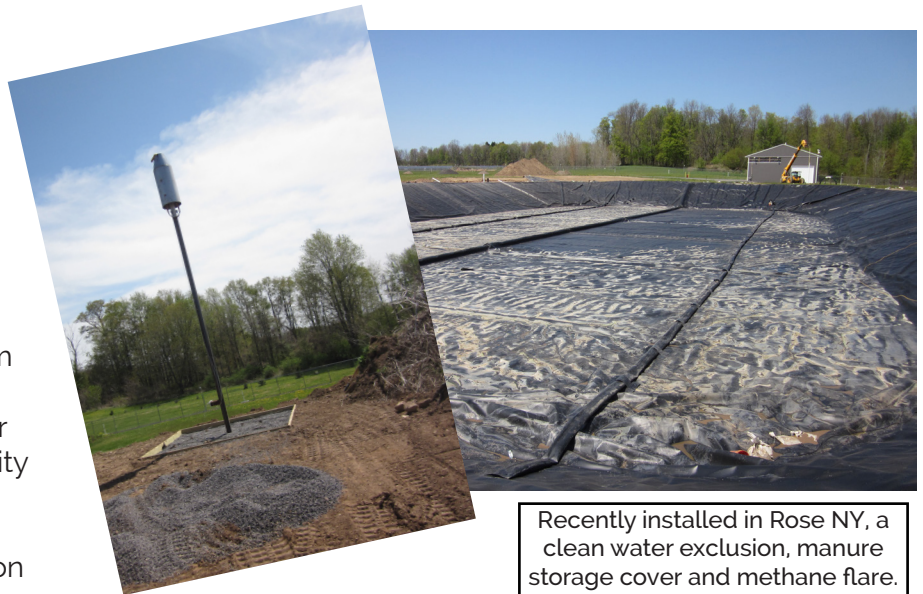
Recently installed in Rose NY, a clean water exclusion, manure storage cover and methane flare.

New York State Grown & Certified (G&C) – is a marketing program that targets people seeking source certified and environmentally sound food. This program is offered different each year and sometimes address operational improvements that include environmental improvements as well as economic ones. Example, Production Waste Disposal; Agri-Chemical Mixing Facilities; Irrigation Systems & Well Development; Energy reduction through green energy.